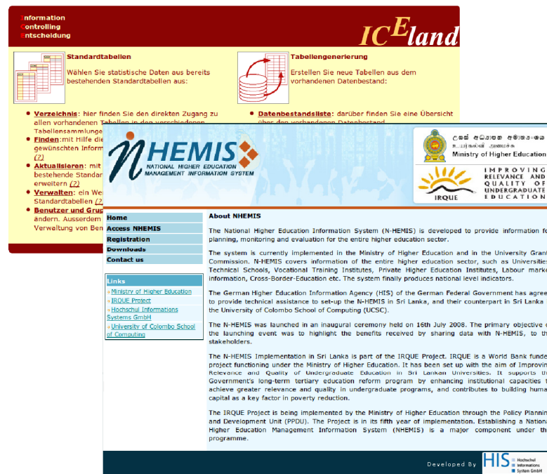
Homepages of some eduSTORE systems: ICEland (Germany) and N-HEMIS (Sri Lanka)